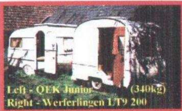
Left - OEK Junior (340kg) Right - Werferlingen LT9 200